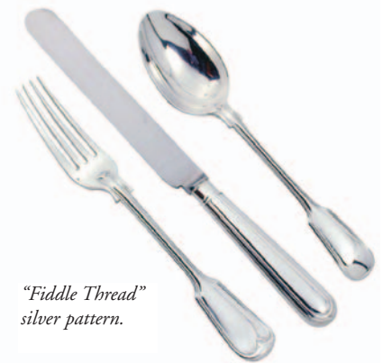
"Fiddle Thread" silver pattern.