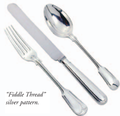
"Fiddle Thread" silver pattern.