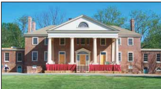
Montpelier restored.