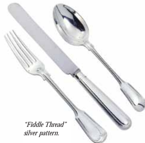
"Fiddle Thread" silver pattern.